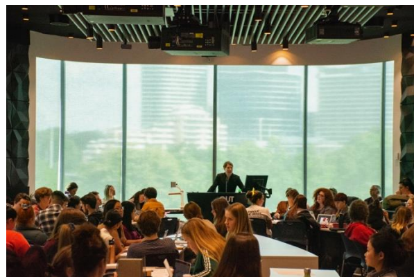
Above: Lecture to Impact Lab students on visualisation techniques

Research on cross-cultural design for health and well-being, I aim to design more inclusive systems, services, and products for the community.